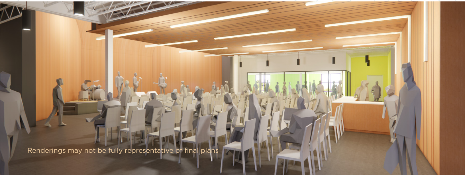
Renderings may not be fully representative of final plans

In remaining attentive to God's guidance to reach our community, we anticipate an increasing number of individuals across all ages seeking baptism. As part of our Path Forward initiative, we plan to create a new dedicated baptismal area to provide a sacramental experience designed to accommodate infants, children, teenagers, and adults.